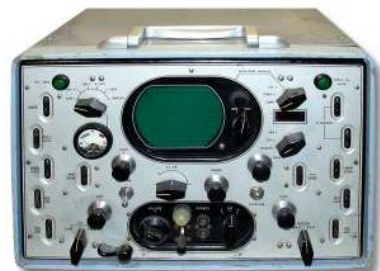
Pye Mk4 CCU

ITV and world export. Anglia and ATV had some and I understand BBC had a few?