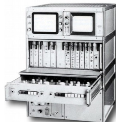
CCU and controls

The 1516P version was the companion portable weighing 8Kg. and the Auxiliary pack 12Kg