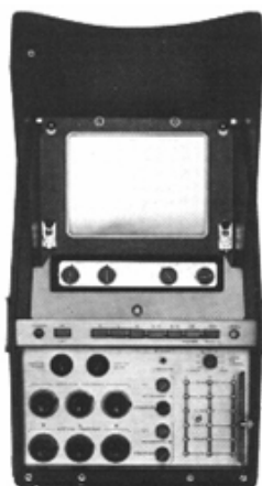
Rear view of BC-230

Developed to BC-230B dated May 1973 (product catalogue)