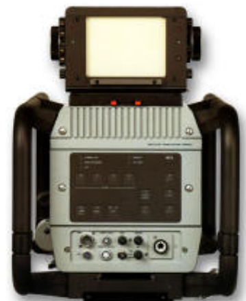
Rear View of LDK910 camera