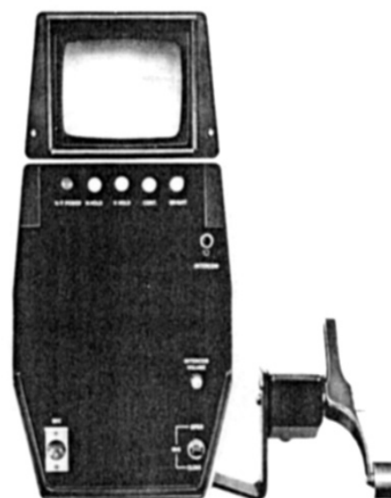
CEI 280 rear view