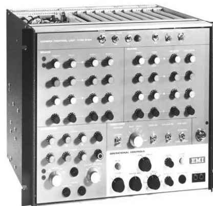
The 2001 CCU

BBC, ITV companies, World exports, and that 350 were eventually sold.