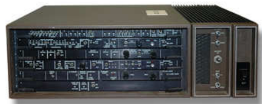
The 2008 Electronics unit

Lightweight shoulder mounted camera with swivel arm viewfinder mount. Microprocessor control, with messages on viewfinder, good auto black, white and centering, stable registration. Small complex backpack electronics unit capable of AC mains or 12v. battery operation. Minimal talkback systems.