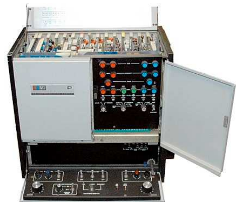
IVC 7000p Control Pack (CCU)

LWT, Thames, HTV, Molinare, Telluloid, Grampian, in the UK. In 1978 it was reported that 27 IVC7000p were in use in the UK. The 7000p cost $48,000 in 1975.