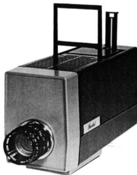
Mini Compact Camera with Optional Sync Adapter

For installations requiring camera synchronization, the optional LDH-4310-S Sync Adapter (which attaches to the bottom of the LDH-0051) permits external synchronization from separate H and V drive pulses, and each unit is provided with a horizontal phasing adjustment to correct timing. Upon removal of the H and V drive pulses, the LDH-0051 automatically reverts to the built-in 2:1 interlaced scanning mode. Optional automatic iris controls are available to optimize camera operation in those situations where the light level variation exceeds the rated range of the camera. Camera video output level is stabilized through a combination of iris variation and vidicon target control.