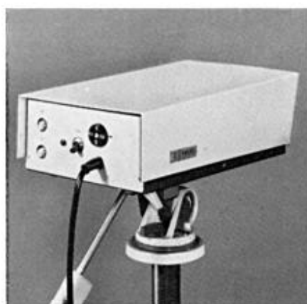
Rear view of the camera

625 lines - 50 fields/s; random interlaced 525 lines - 60 fields/s; random interlaced