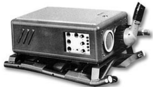
The LDK13 electronics backpack & frame

In use the camera mounted well forward of the shoulder on a chest and stomach brace. The backpack could be worn by the cameraman or an assistant.