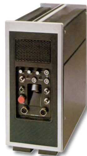
PPU for LDK15

The BBC Manchester two camera unit. Scottish outside broadcasts.